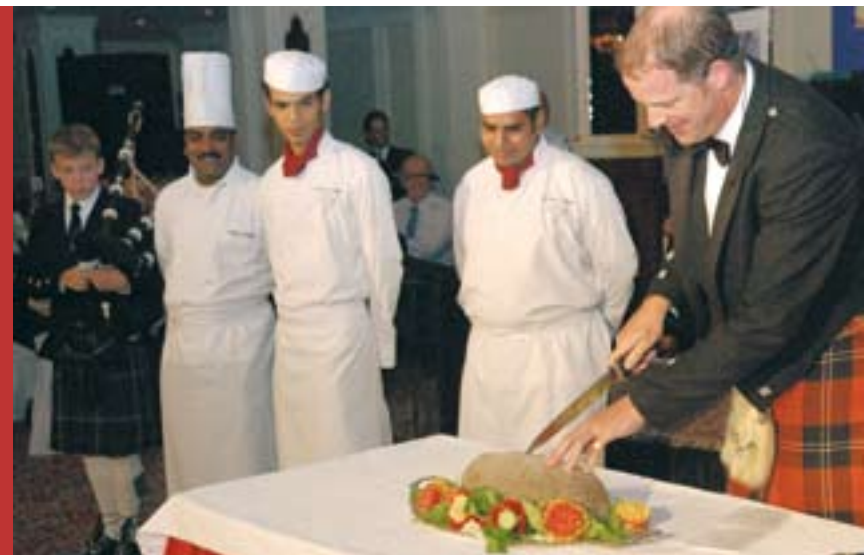
Cutting the Haggis